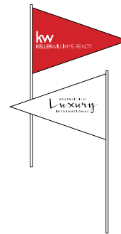
6" TWO PIECE PVC FLAG & POLE